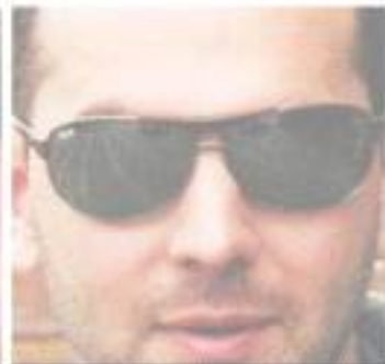
listen to music