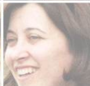
cinema or theatre