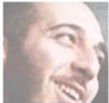
go to the sea