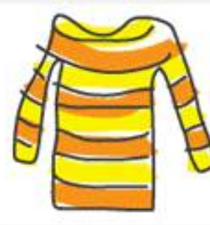
dress with colors

remembering is smelling something, it's an event, a picture, a drawing... mind's drawings as simple as kid's drawings