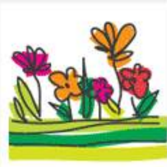
make a garden