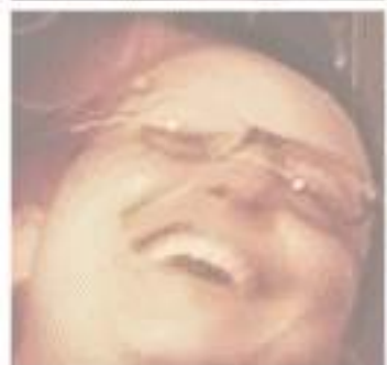
a good wine