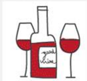
a good wine