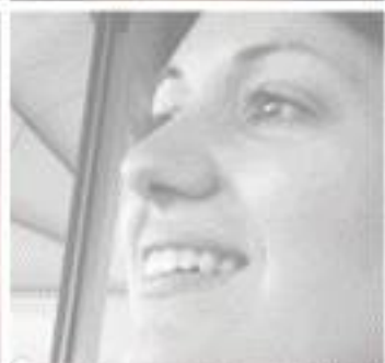
dress with colors

remember to think, plan or make something you love