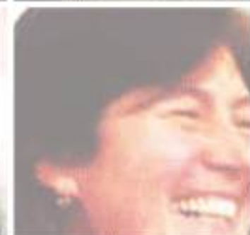
call a friend