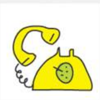
call a friend