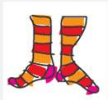
put on socks+colors