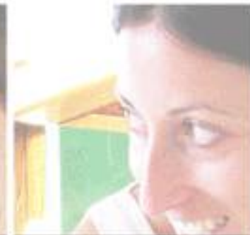
make a garden